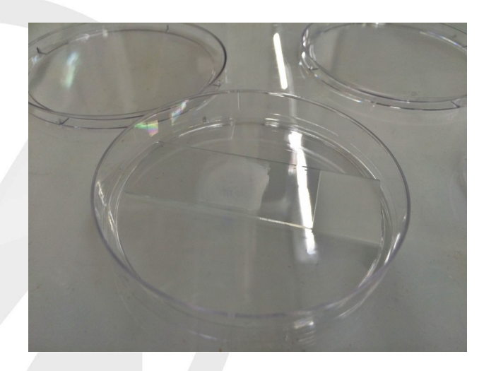
The photo above shows glass carriers inoculated with microorganisms