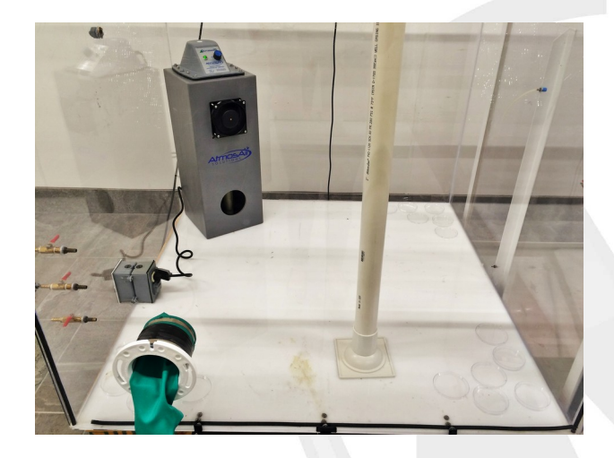
The photo above shows the Matterhorn treating inoculated slides inside the test chamber